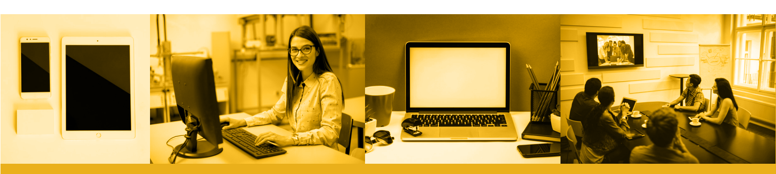
TABLET • SMARTPHONE • PC • LAPTOP • ROOM SYSTEMS